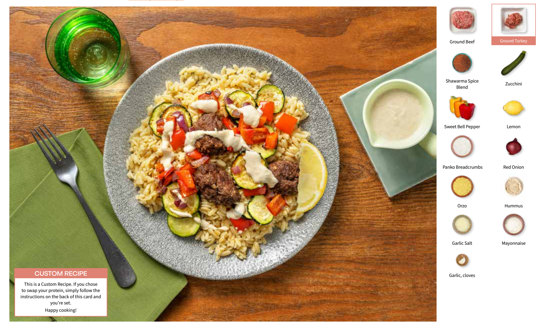
It looks like rice but it's actually pasta!