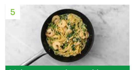
Make sauce and assemble